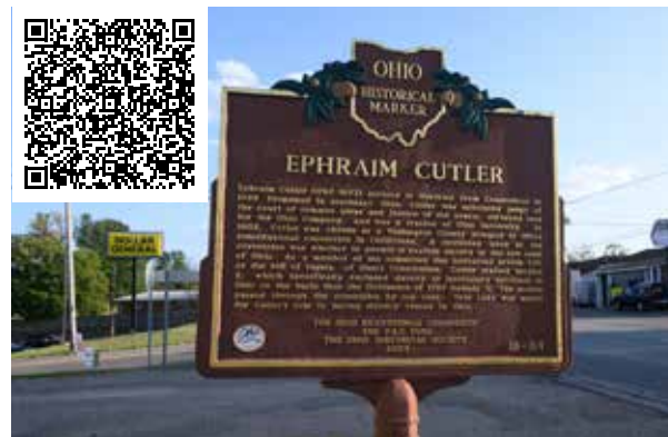
Veto – “Ephraim Cutler” Marker – The marker details the life of Judge Ephraim Cutler and his role at the Ohio Constitution Convention in 1802 and his fight to “veto” the slavery issue in the Ohio Constitution, making it permanently a free state. [GPS 39.342100, -81.671733]