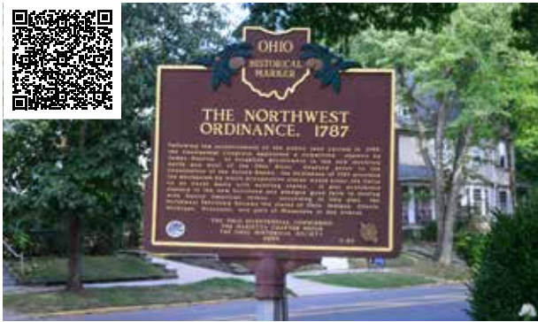
Marietta – “The Northwest Ordinance, 1787/The Ohio Company Purchase” Marker – This marker celebrates the Northwest Ordinance of 1787 that created new territories north of the Ohio River. The document included many of the precursors of our Constitution’s Bill of Rights, but went further by prohibiting slavery, promoting public education, and pledged good faith in dealing with Native Americans. [GPS 39.421866, -81.461400]