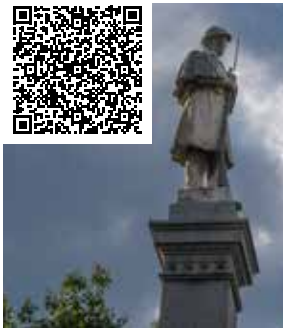
Marietta – Civil War Memorial – Honoring the soldiers, sailors, and marines who fought and died in the Civil War from Washington County. Over 50% of all men between the ages of 15 – 49 in this county joined the Union cause. [GPS 39.414667, -81.456500]