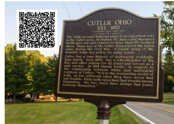
Cutler – “Cutler Ohio” Marker - This marker details the history of this multiracial community that predates the Civil War. It also discusses the nearby Smith Station that gave aid and comfort to more than 150 Freedom Seekers. [GPS 39.352665, -81.791295]

Scan QR codes to find each individual marker or scan the QR code below for driving direction to all Underground markers in Washington County, Ohio.