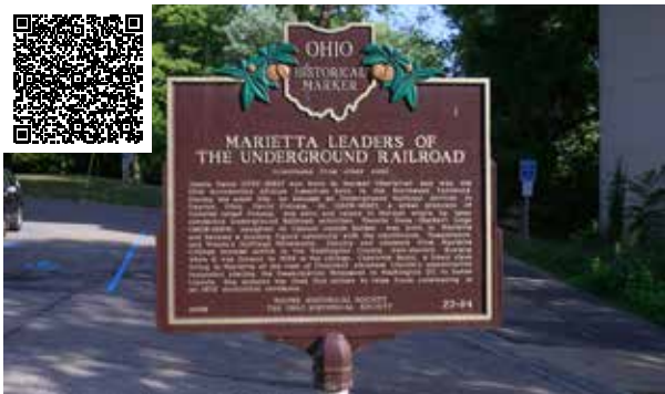
Marietta – “Muskingum River Underground Railroad/Marietta Leaders of The Underground Railroad” Marker – With Marietta being located across from the slaveholding state of Virginia, the local Underground Railroad leaders used the Muskingum River to aid freedom seekers hoping to reach Canada. The marker also discusses the first documented African American born in the Northwest Territory and information about other Marietta leaders. [GPS 39.420267, -81.462850]